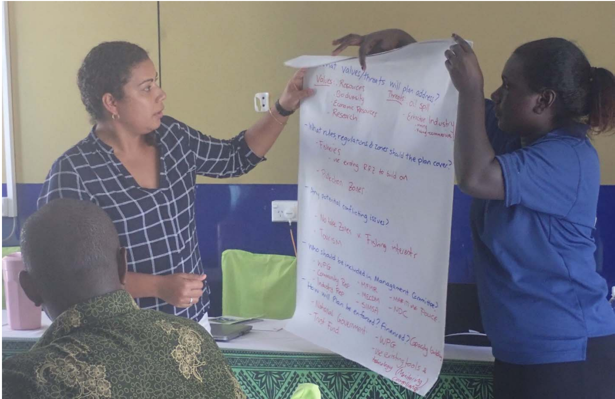
Figure 3. Presentation of ideas and issues raised during group brainstorming on values, threats, rules, conflicts, and management implementation