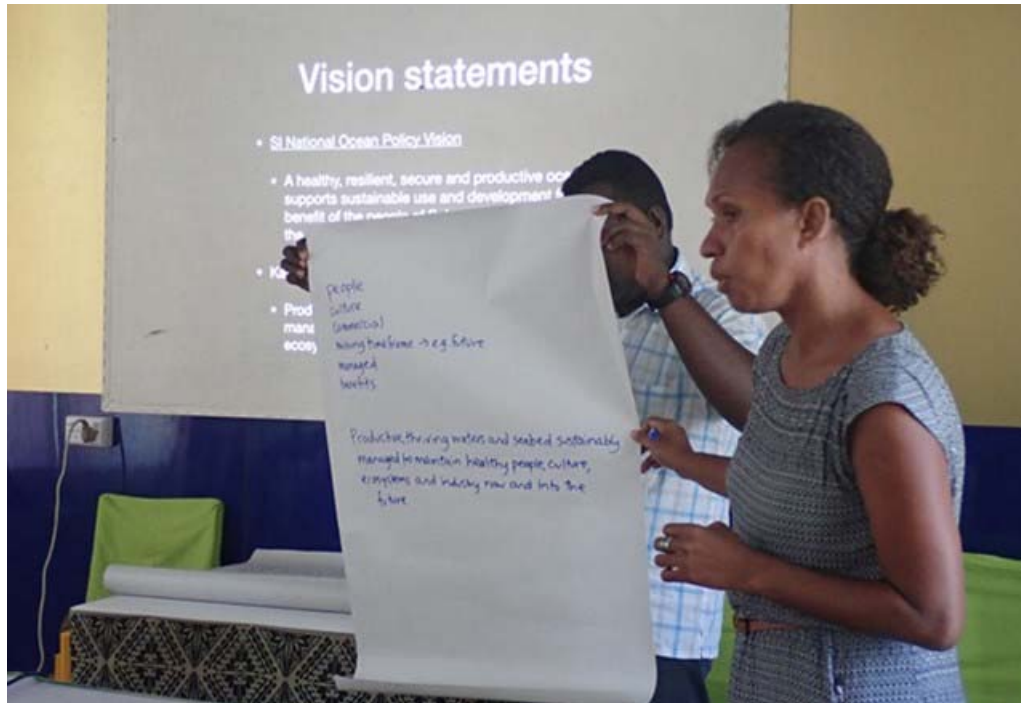
Figure 2. Report back from breakout group discussion on draft vision.